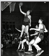
Princeton basketball once played at Hobey Baker Rink.

Hobey Baker Rink was used as a hotel during WWII for servicemen.